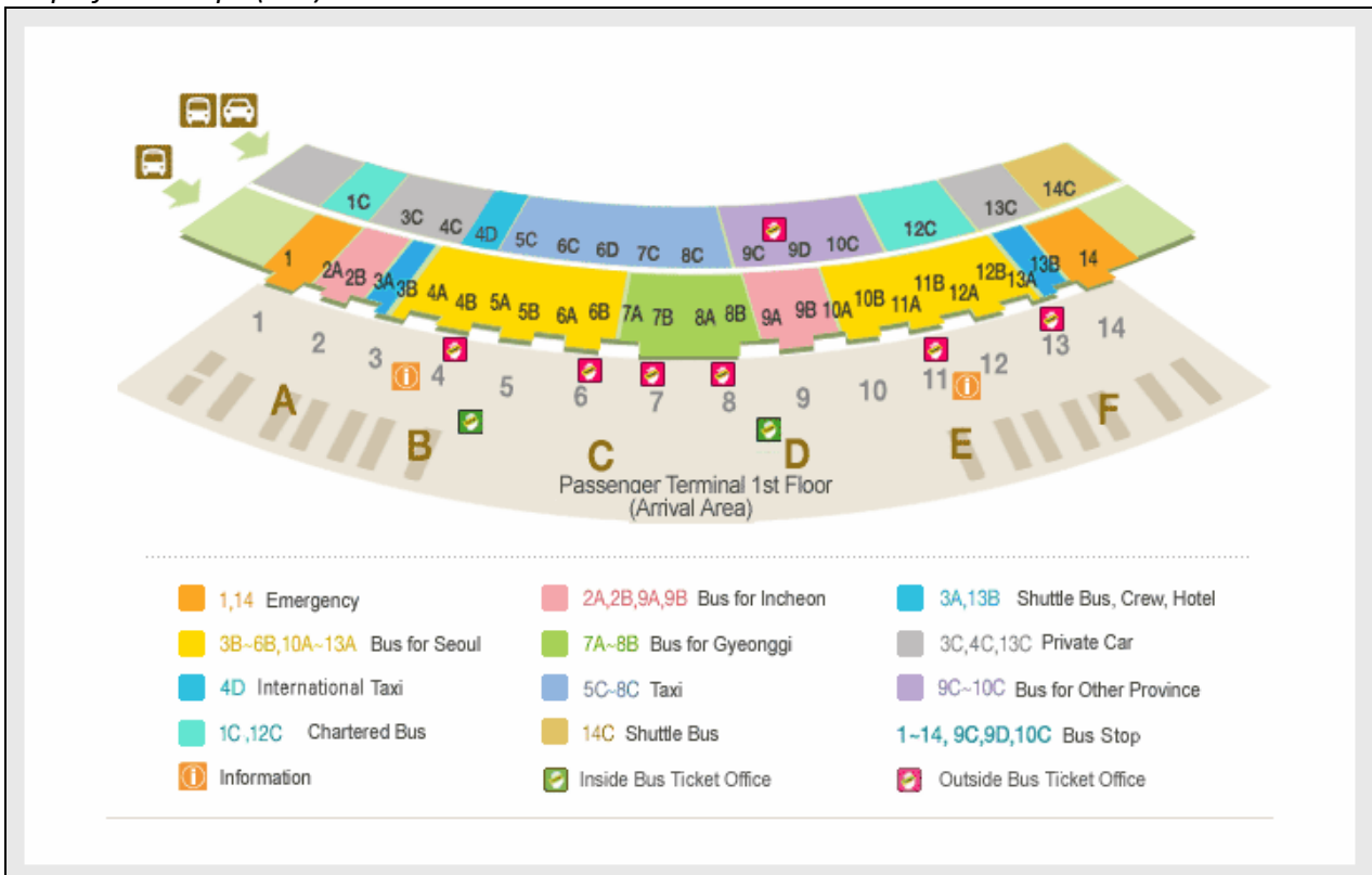
Map of Bus Stops (ICH)